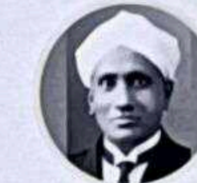
Sir. C.V. Raman Nobel Laureate & Alumnus