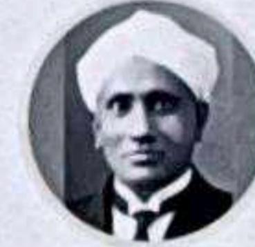
Sir. C.V. Raman Nobel Laureate & Alumnus

UGC-Sponsored Two - Day National Conference on "Science of Disaster Management" 23 rd & 24 th November 2019