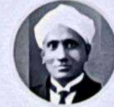
Sir. C.V. Raman Nobel Laureate & Alumnus