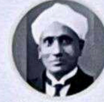
Sir. C.V. Raman Nobel Laureate & Alumnus