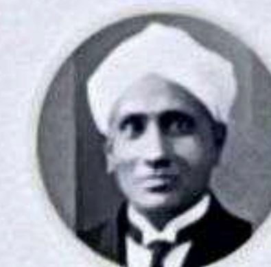
Sir. C.V. Raman Nobel Laureate & Alumnus