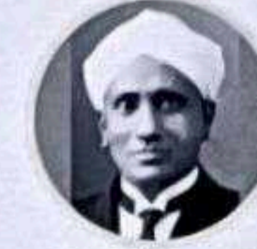
Sir. C.V. Raman Nobel Laureate & Alumnus